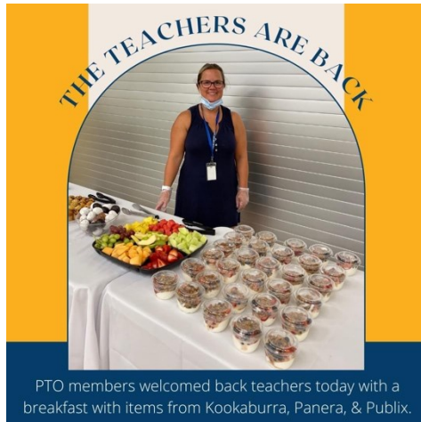
PTO members welcomed back teachers today with a breakfast with items from Kookaburra, Panera, & Publix.

The PTO welcomed back teachers the week of August 9 with a breakfast on Monday and lunch on Wednesday. Kookaburra Coffee, Panera, and Publix helped us with breakfast. Clara's Tidbits Catering helped us with lunch. The PTO also welcomed Kindergartners on Friday, August 16 with a welcome parade and balloons by Party Time Designs.