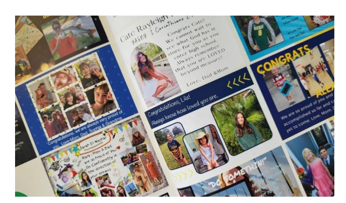
Both 8<sup>th</sup> grad ads and books are purchased at www.buytheyearbook.com School Code: 717935

Yearbooks are still available at a current cost of $42. 8 <sup>th</sup> grade families - the deadline to purchase 8<sup>th</sup> grade recognition ads is coming up... Feb 14th. The cost for the 1/8<sup>th</sup> page space is $25.