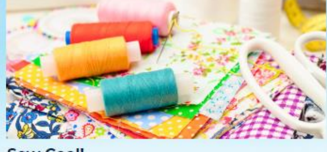
Sew Cool! June 23 - 27, 2025 | 9 a.m. - 4 p.m.

Stitch your way to style! Practice the basics of sewing, from simple stitching to pattern construction, and be inspired to express your uniqueness through fabric and design.